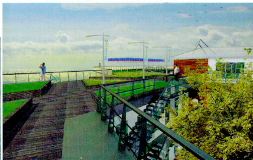
LEFT A concept vessel from Blueseed would enable residents to live, work, eat, and play two dozen miles off the U.S. coast.